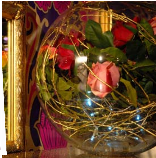
Table centres are an important part of any event and holds the whole room together.

The list below shows an idea of what we have available. These table centres come with candles but not with floristry. Please enquire for prices and to discuss any centrepiece ideas you may have in mind.